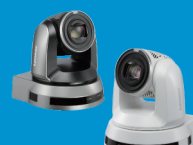
VC-A61P 4K 30fps IP PTZ Camera