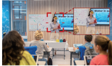
Hybrid Audio-Visual Tracking Algorithm