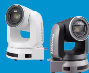
VC-A71P 4K 60fps IP PTZ Camera