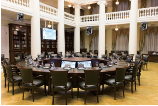
Multiple Camera Auto Switch