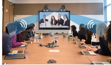
Voice Tracking Camera Control