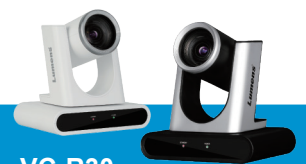
VC-R30 Full HD IP PTZ Camera