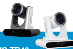
VC-TR40 AI Auto-Tracking Camera